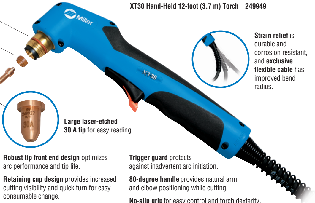
XT30 Hand-Held 12-foot (3.7 m) Torch 249949