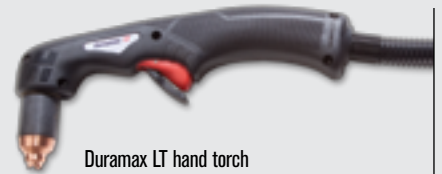
Duramax LT hand torch