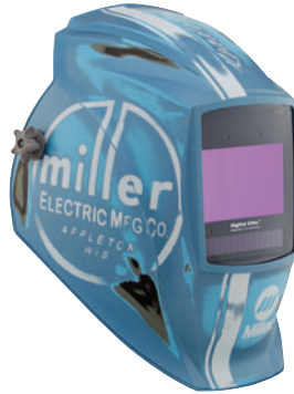
Vintage Roadster™ 281004