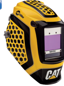
CAT® Cat® Edition 1 281006