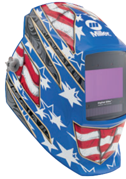
Stars and Stripes™ III 281002