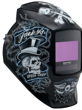
Lucky's Speed Shop™ 281001