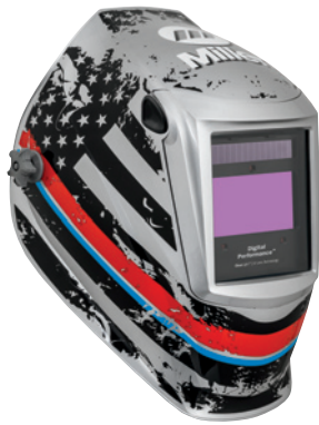
NEW! Unity™ 282006