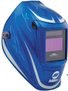
'64 Custom™ 289807