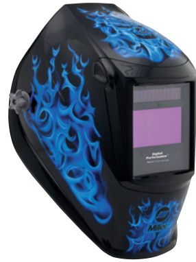
Blue Rage™ 289802