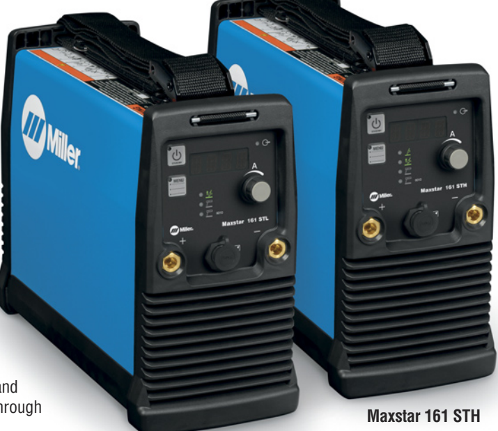
Maxstar 161 STL

Built-in gas solenoid eliminates the need for a bulky torch with a gas valve.