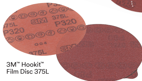
3M™ Hookit™ Film Disc 375L