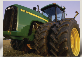
Great paint lines