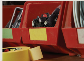
Perfect for labeling